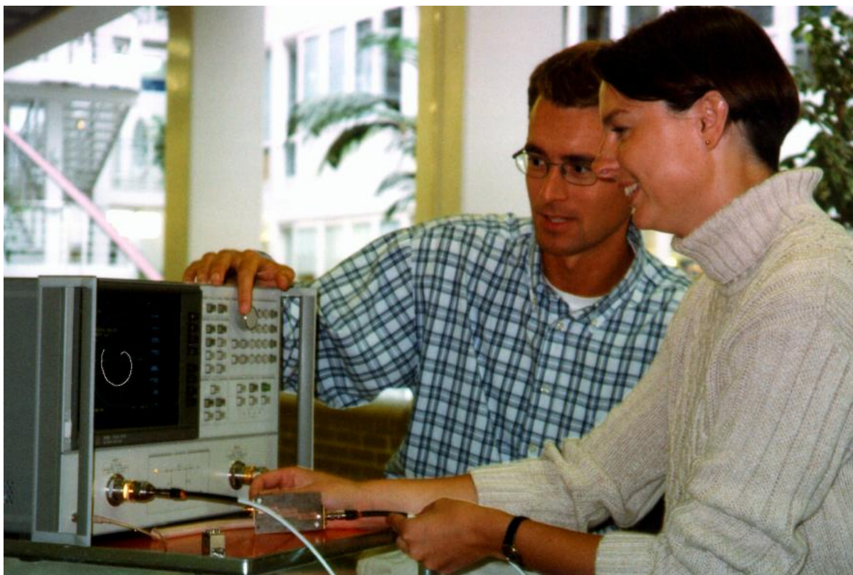
Laboratory under the palm trees in the beautiful Electrum in Kista

Course description for the academic year 18/19